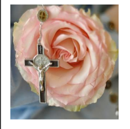
Pray for the Unborn

Chad Hickey DC 7857 Velte Road → Lake Odessa, Mi 48849 P 616-374-7880 www.vikingchiropractic.com