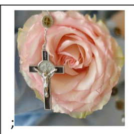
Pray for the Unborn

Mon., Tues., & Thurs., 8-12 & 3-7 Fri., & Sat., 8-12 Phone (616) 374-7880